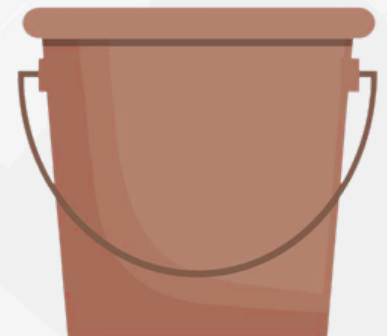
30 Kg Bucket